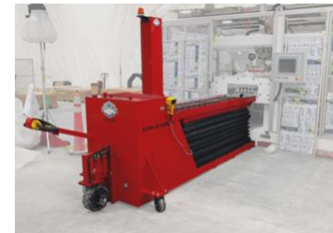
At Industrial site